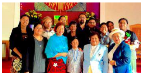
Lay Marists make commitments, Otara, Auckland. May 2016

Mary's Family is Growing: A great joy has been the first commitment of 14 new Lay Marists in the Otara parish. The group began meeting last year to discern what it means to be Marist as Laity.